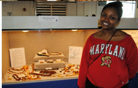
GLMSMC Montgomery County Show Gaithersburg, MD