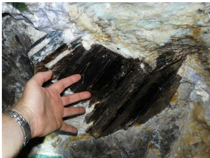
Huge "book" mica abounds in this mine.