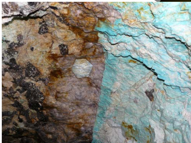
That Hexagon is a ~6" diameter crystal of Aquamarine! WOW!! (Found in the ceiling at the 60 foot level.)