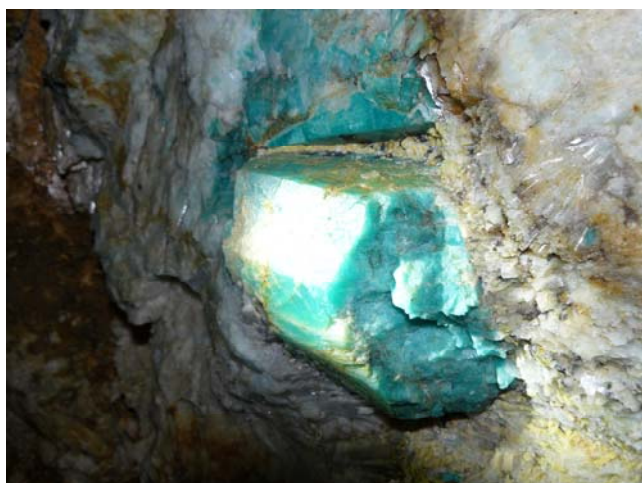
Crystal faces of amazonite are apparent in this photo of a ~6" long, ~4" diameter crystal.