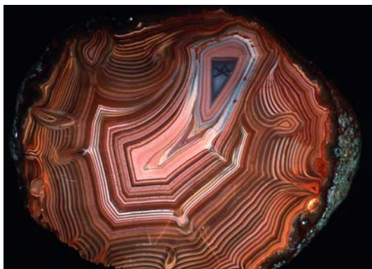
Lake Superior Agate