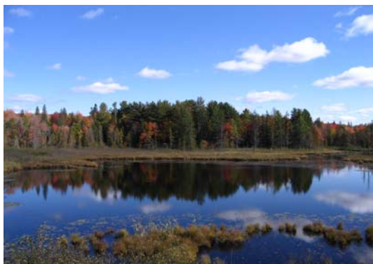
Copper Country Color

AND BEST WISHES TO THE NVMC FOR A MEMBER PROSPEROUS NEW YEAR