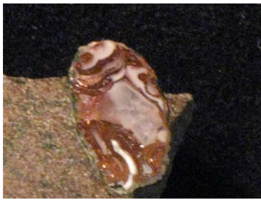
Latest In Lake Superior Agates