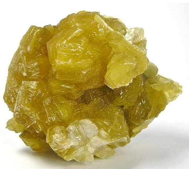
Lepidolite from Itinga, Minas Gerais, Brazil.

26: Arlington, VA —Monthly meeting; Micromineralogists of the National Capital Area; 7:45–10; Long Branch Nature Center, 625 S Carlin Springs Rd.