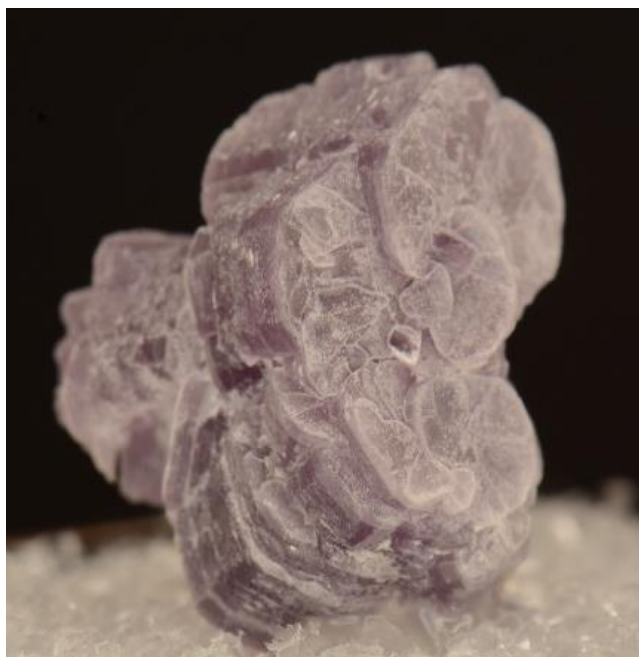
Lepidolite from the Himalaya Mine, San Diego County, CA.

alloyed with other light metals like aluminum and magnesium for aerospace and other technologies that require—and can afford—very light metals.