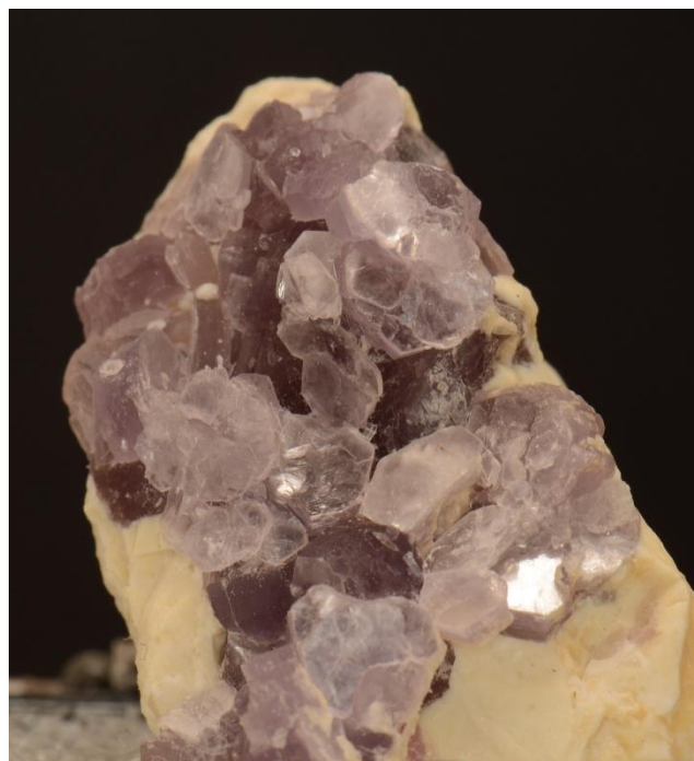
Lepidolite from the Himalaya Mine, San Diego County, CA.

Lepidolite has been mined for lithium, although cheaper sources are currently preferred. Lithium is the lightest metal—lighter than aluminum. Most lithium produced is used for batteries, with some going into ceramics (due to the high melting point of lithium), lubricants, and other minor uses. Lithium can be