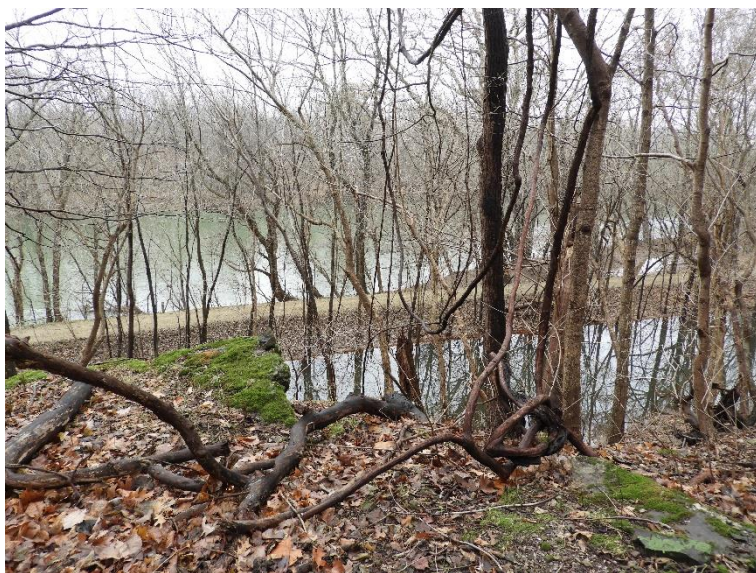
View of the Potomac River from the quarry.

Further search in this “high mass in Maryland” above White’s Ferry revealed that the land was broken roughly into two bluffs, with a deep ravine between them. A thorough search was made of the area, to no avail.