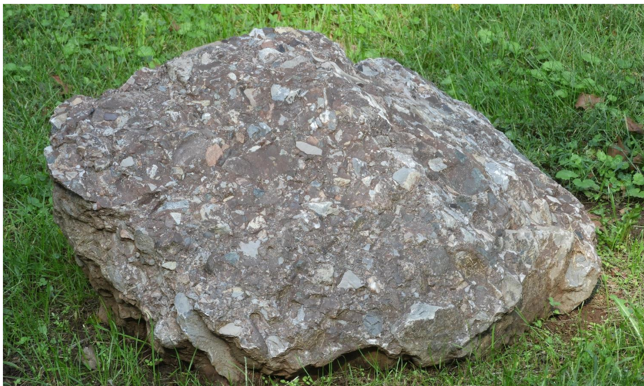
Potomac marble boulder in Leesburg, VA.