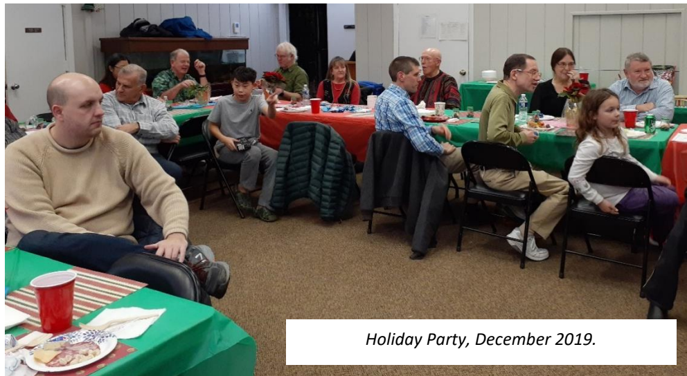
Holiday Party, December 2019.