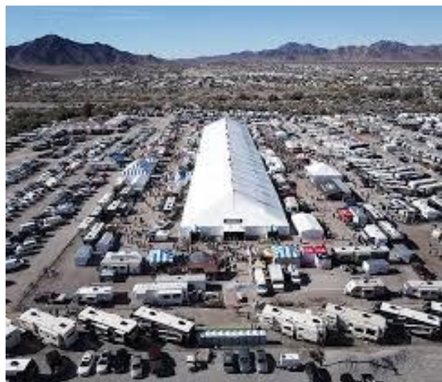
Quartzsite venue in Arizona.

The American Lands Access Association (ALAA) has been holding one of its two meetings there each year, along with a trash cleanup in coordination with BLM on public land. Check the ALAA website for more details.