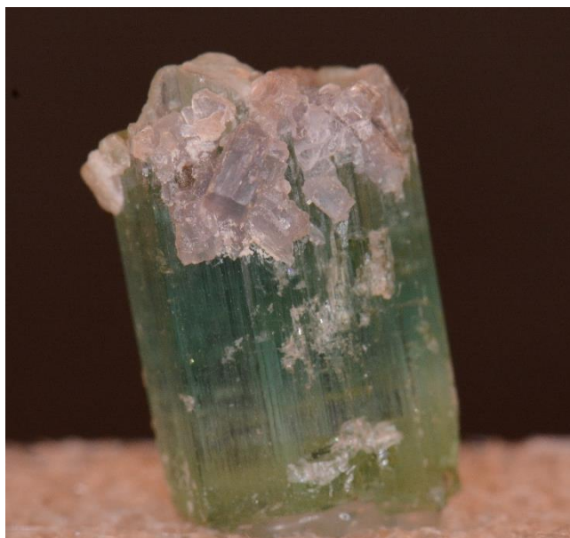
Lepidolite on tourmaline from the Dunton Mine, Newry, ME.

Accordingly, lepidolite is found in pegmatites, the very coarse-grained rocks of granitic composition that host a wealth of interesting minerals. Massive or sub-crystalline lepidolite often forms the matrix for more valuable or sought-after minerals like tourmaline of diverse species or members of the beryl group. “Euhedral” crystals show obvious crystal faces, with most faces present and unattached to other minerals. Euhedral lepidolite crystals are relatively rare, although balls of lepidolite scales are an interesting addition to any collection.