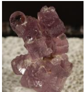
Mineral of the Month: Lepidolite