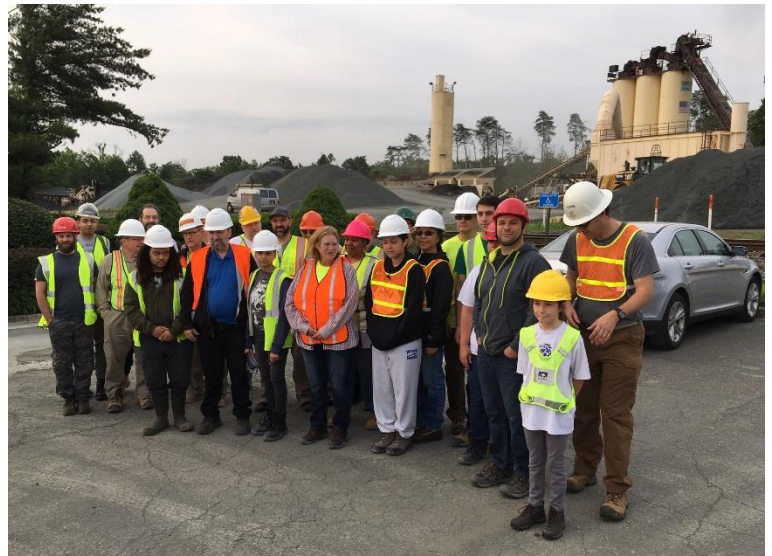
Collecting at the Vulcan Quarry in Manassas, VA.