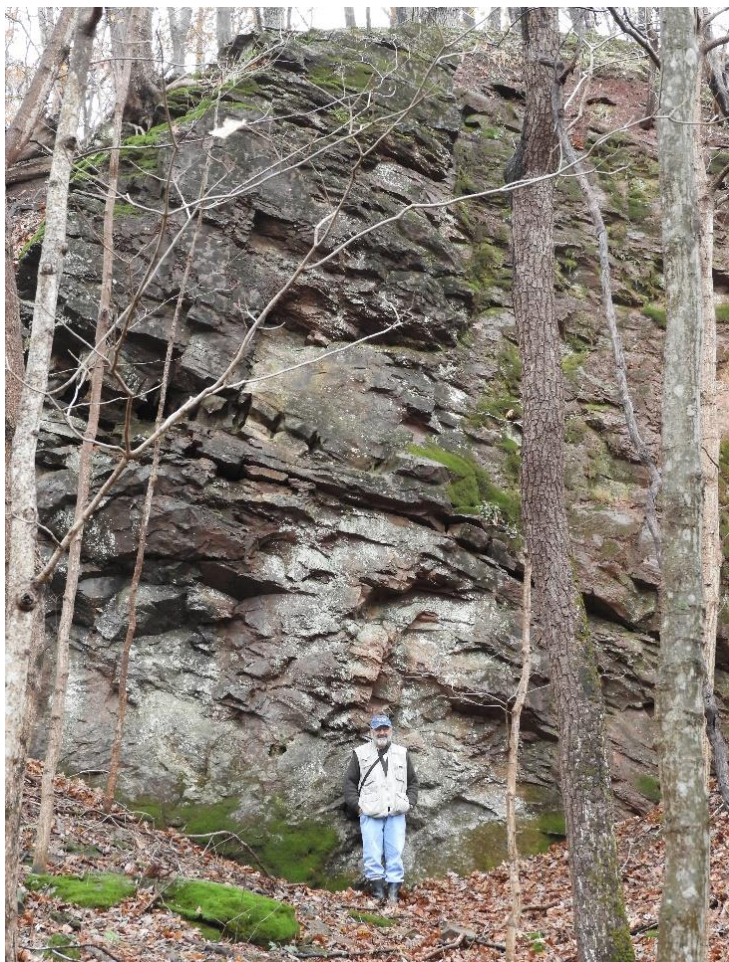
The author standing in front of the east wall of the quarry.