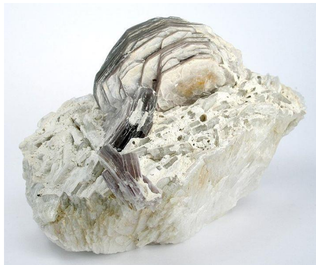
Lepidolite with boromuscovite from the Little Three Mine, San Diego County, CA.